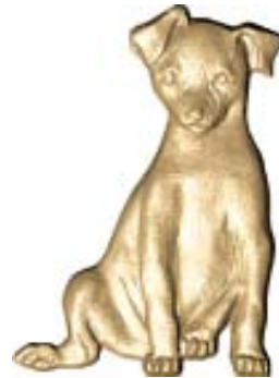
PUPPY BR 389