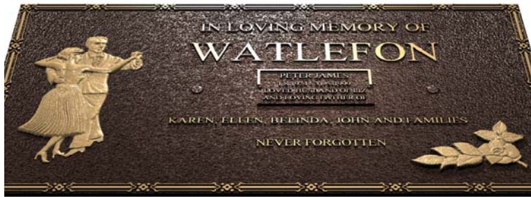
Base Plaque with first interment

Married couples or partners often wish to be memorialised on a single plaque. Since in most cases they pass away at different times, Phoenix provides for this situation with Dual Plaques containing Detachable Plates.