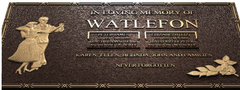
After second interment