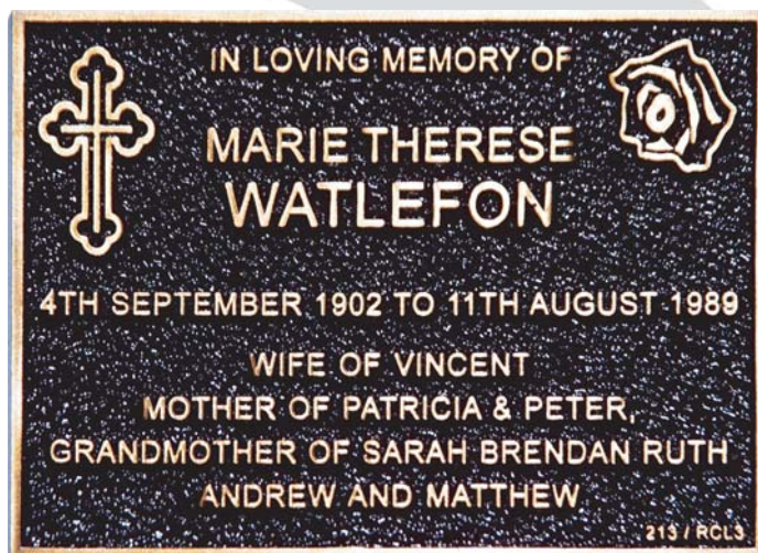
Micro Inscription Plaque (actual size)

> Honour Rolls : Inscription size together with number of names usually means honour role plaques can be quite large. The size can be significantly reduced with micro inscription.